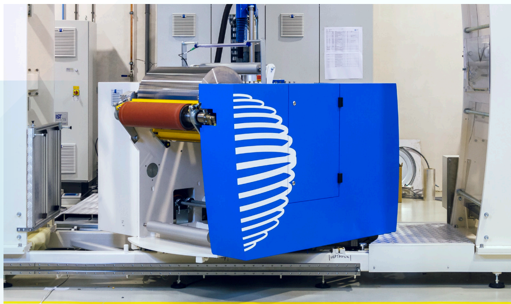
Hotmelt Coating Station

For more information, contact us so that we can configure the machine to your requirements.