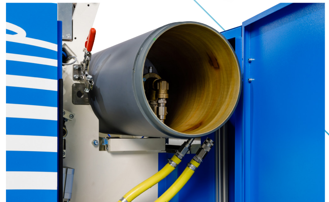
Sleevesystem op coatingwals