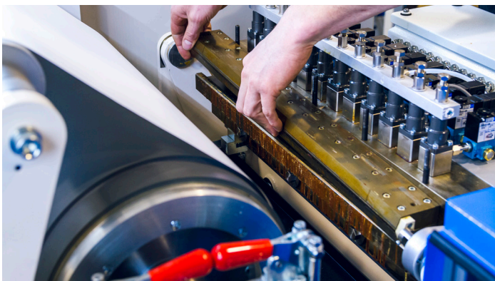
Exchange system for DieRect Roller Nozzle and SlotNozzle